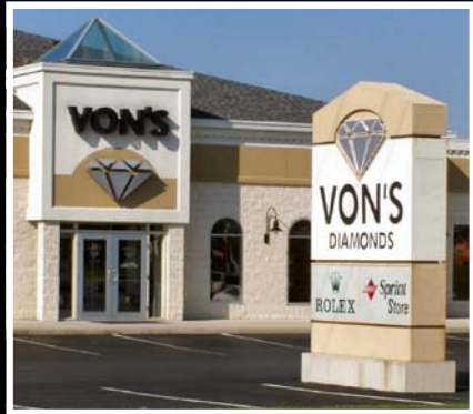
Monument - Channel Letters Sign