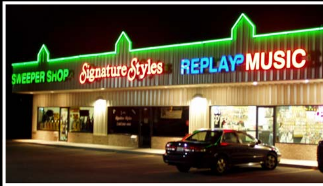
Lighted Channel Letters with Neon Border