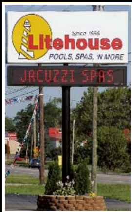
LED Message Centers

1-800-776-3380 419-228-4140 Email: sales@corpsigns.com